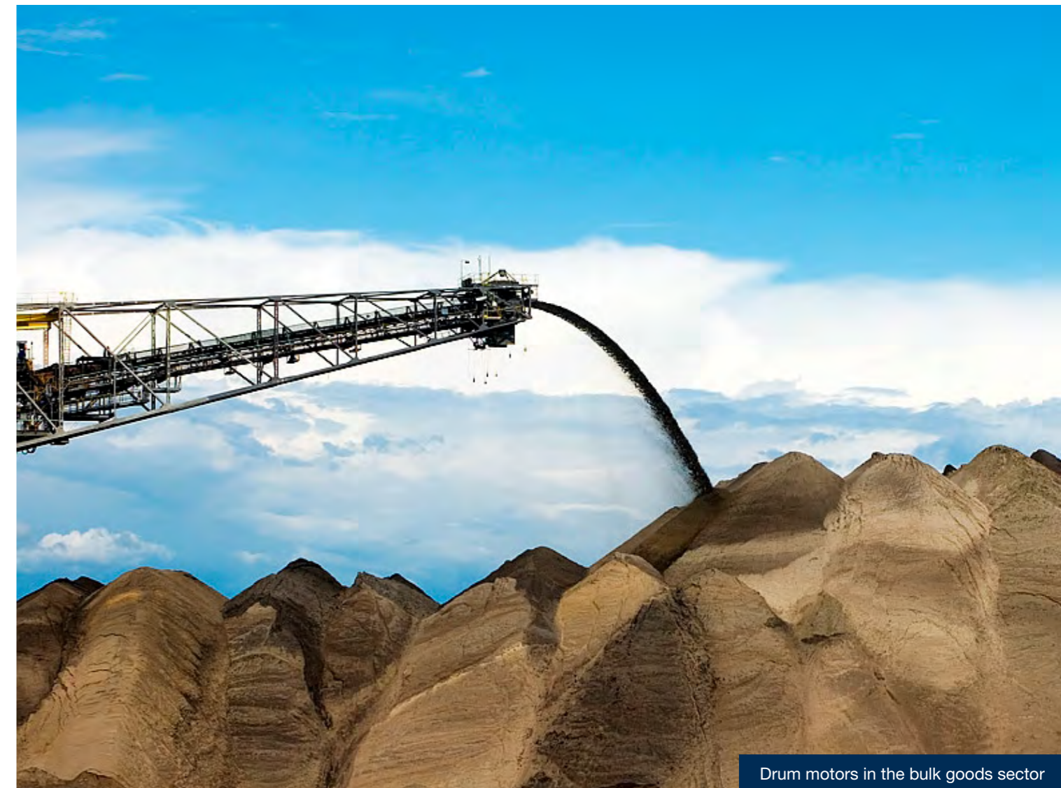
Drum motors in the bulk goods sector